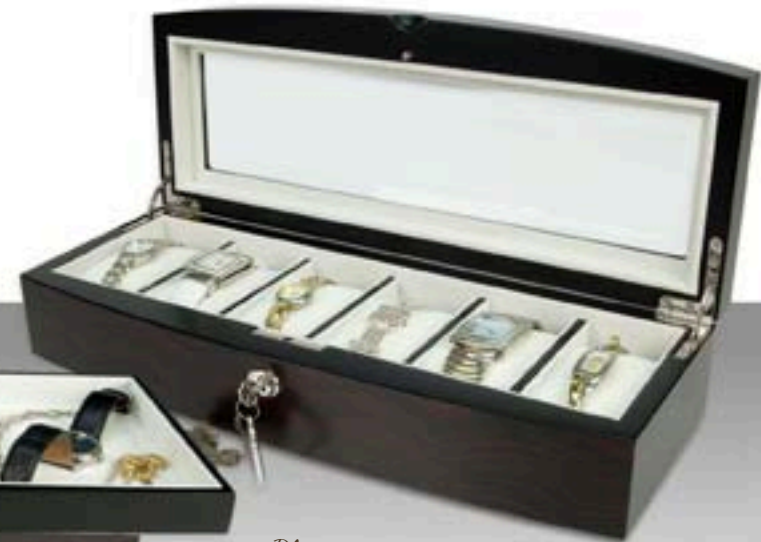
Phoenix by Madison Burke See page 12

Our premier collection of jewellery storage boxes - Madison Burke Designs, features unrivaled craftsmanship and the finest of materials.