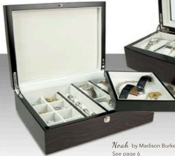
Noah by Madison Burke See page 6