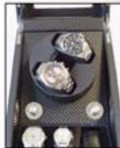
Use two watch pads.