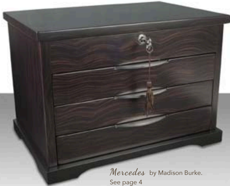
Mercedes by Madison Burke. See page 4