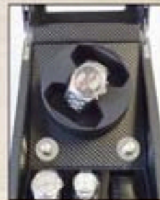
OR Use one watch pad.