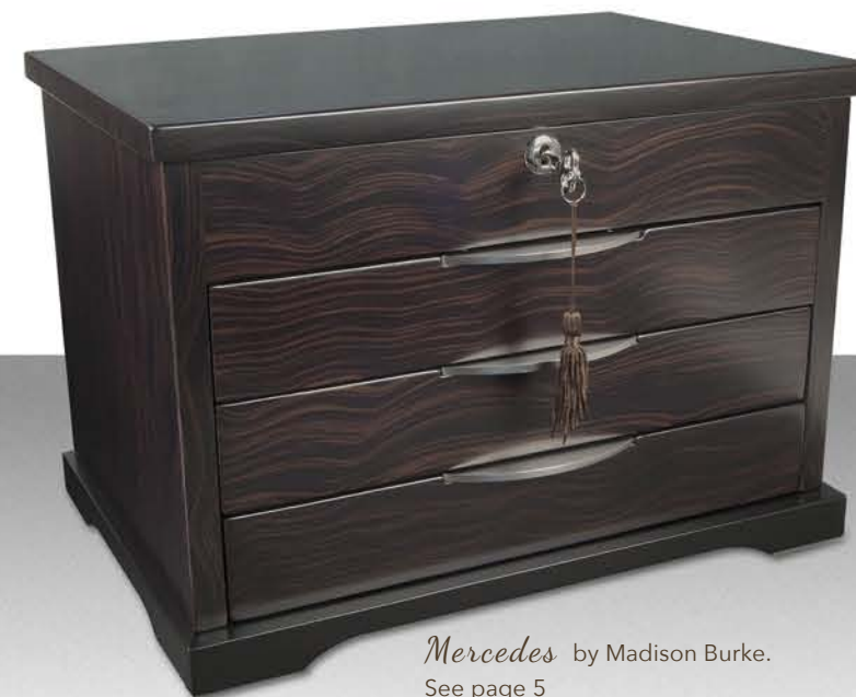
Mercedes by Madison Burke. See page 5