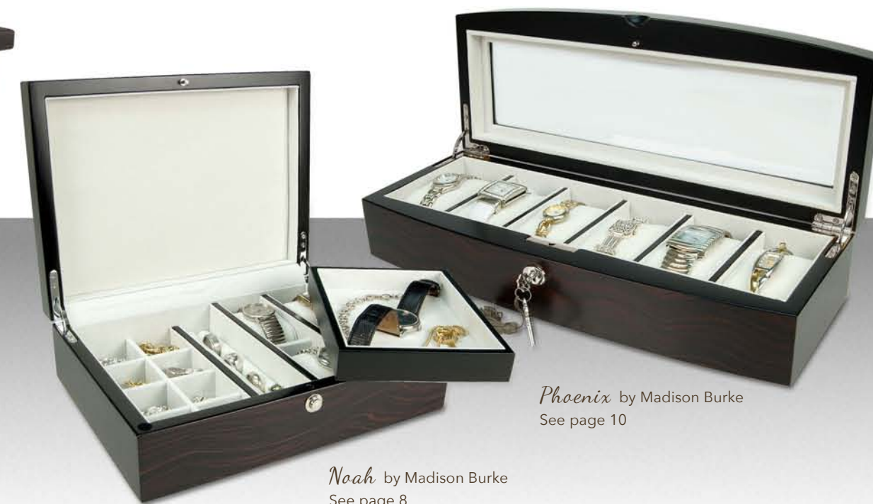
Phoenix by Madison Burke See page 10