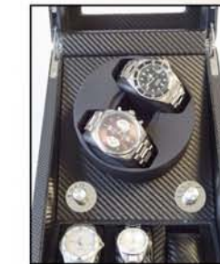
Use two watch pads.

Auto switch off - switch on to automatically stop the winding mechanism when the lid is lifted allowing for easy removal of your watches.