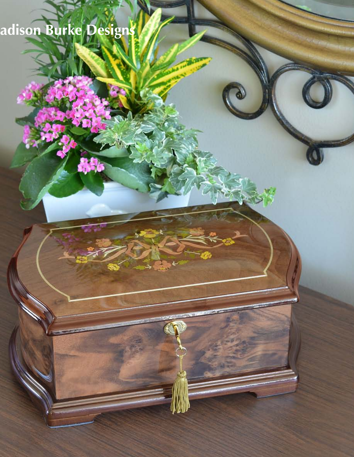
Talia by Madison Burke 83808320

Fine jewellery calls for the finest storage. This elegant musical jewellery case features a high gloss finish, accented by walnut burl. The floral design on the lid adds a touch of elegance as you open this exquisite case. Made of the highest quality velvet, the interior lining will keep even the most delicate jewels scratch and damage free. A removable sectioned tray with ring rolls will keep your rings and other smaller pieces organized, without worry of scratching or damage. A 22 note musical movement plays the theme from "The Celebrated Canon", as you admire your favourite jewellery. Hidden quadrant hinges, lock and key complete what might be the finest jewellery box you will ever purchase.