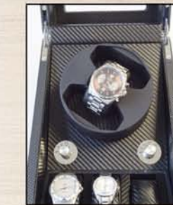
OR use one watch pad.

Go to our site to see watch manufacturer recommended turns.