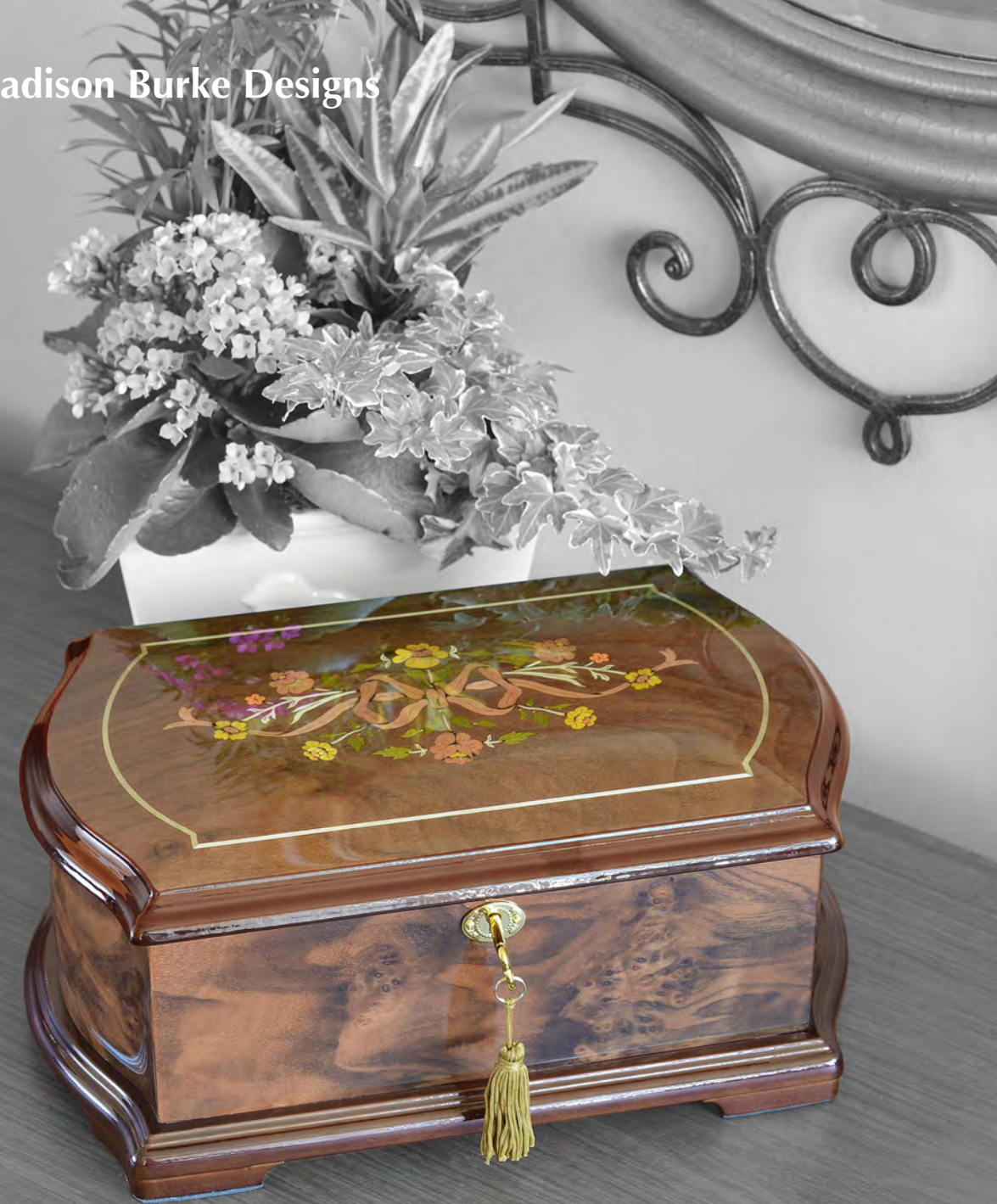
Talia by Madison Burke 83808320

Fine jewellery calls for the finest storage. This elegant musical jewellery case features a high gloss finish, accented by walnut burl. The floral design on the lid adds a touch of elegance as you open this exquisite case. Made of the highest quality velvet, the interior lining will keep even the most delicate jewels scratch and damage free. A removable sectioned tray with ring rolls will keep your rings and other smaller pieces organized, without worry of scratching or damage. A 22 note musical movement plays the theme from "The Celebrated Canon", as you admire your favourite jewellery. Hidden quadrant hinges, lock and key complete what might be the finest jewellery box you will ever purchase.