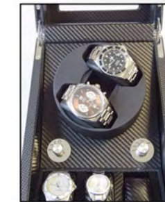
Use two watch pads.

Auto switch off - switch on to automatically stop the winding mechanism when the lid is lifted allowing for easy removal of your watches.