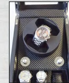
OR use one watch pad.

Go to our site to see watch manufacturer recommended turns.