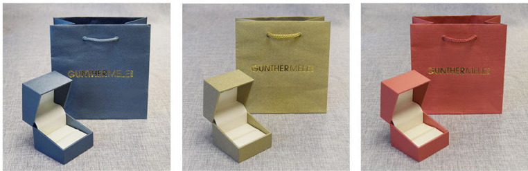
Shown in Celestial Blue Shown in Moss Shown in Brick

Available in 16 colors in a selection of 4 luxurious textured papers.